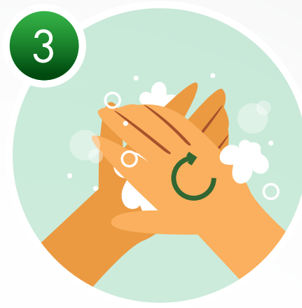
RUB HANDS PALM TO PALM