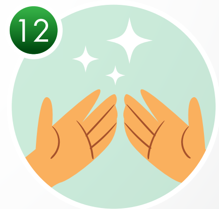
YOUR HANDS ARE CLEAN