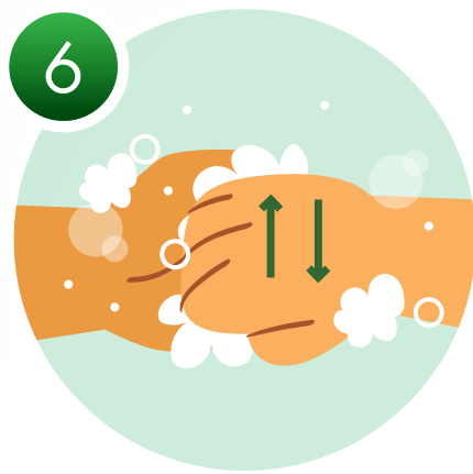
RUB THE BACKS OF FINGERS ON THE OPPOSING PALMS