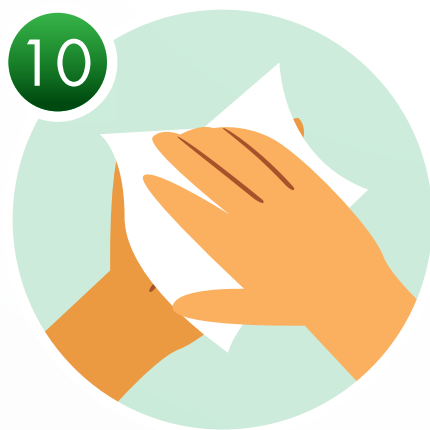
DRY WITH A SINGLE USE TOWEL