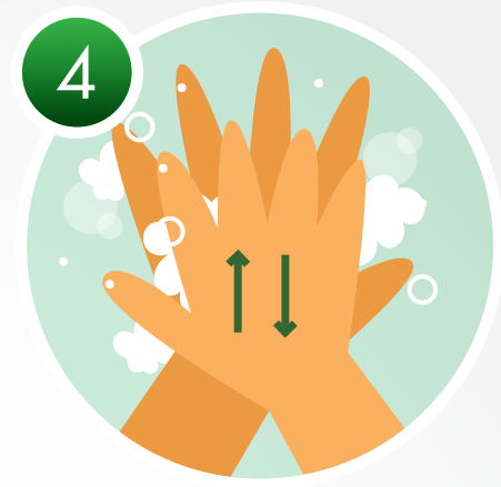
LATHER THE BACKS OF YOUR HANDS