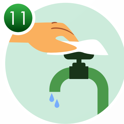
USE THE TOWEL TO TURN OFF THE TAP