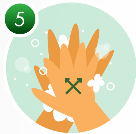
SCRUB BETWEEN YOUR FINGERS