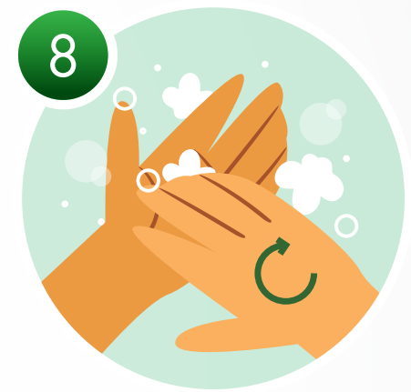
WASH FINGER- NAILS AND FINGERTIPS